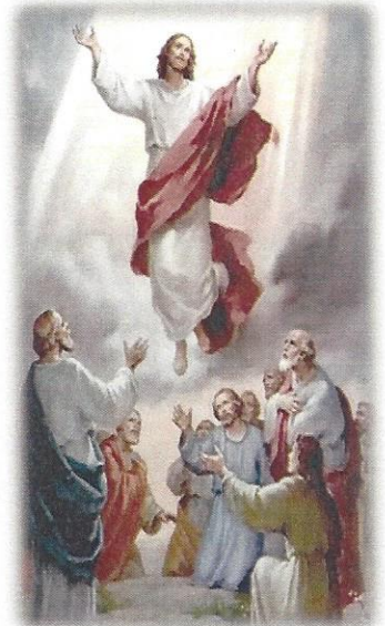
The Ascension of Our Lord Jesus Christ- "Jesus ' Led them out near Bethany, and with hand up-raised, blessed them. As he blessed, he left them, and was taken up to heaven

Later we visit Emmaus , where Jesus, appeared after his reserection to two of his disciples while they were walking on the road to Emmaus . (B.D)