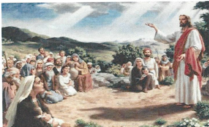
The Sermon on the Mount- When Jesus saw the crowds he went up to the mountainside. After he had sat down his disciples gathered around him, and he began to teach them -MT 5:1 MT. BEATITUDES

Today Marks the magic moment when you board your flight to The Holy Land.. Breakfast & Dinner served in flight.