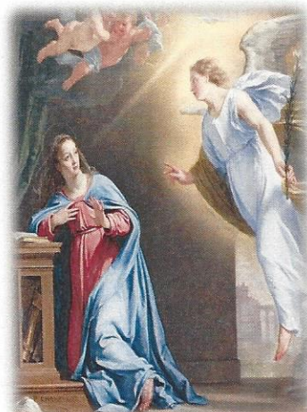
The Annunciation of the Blessed Virgin Mary- “The angel Gabriel was sent from God, to a virgin. Upon arriving the angel said to her “Rejoice, O highly favored daughter” -LK 1:26-28

This morning after breakfast we drive along the coastal road we arrive in Caesarea - The former Roman Capital of Israel . Here you'll see the Amphitheater dating back to King Herod the Great and site of Paul's imprisonment. Later we drive to Haifa and Mount Carmel to visit the beautiful Carmelite Monastery . Next we visit Stella Maris to see the church of the prophet Elijah before continuing to Nazareth for an overnight stay. (B.D)