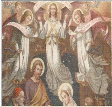
The Birth of Our Lord Jesus-Mary "gave birth to her first born son and wrapped him in swaddling clothes and laid him in a manger, because there was no room" Lk 2, 7

Next is a visit to Mount of Beatitudes (Sermon on the Mount) to celebrate Mass. Followed by Capernaum to see the ancient Synagogue where Jesus preached. While in the Galilee we ascend Mount Tabor to visit the Church of The Transfiguration and enjoy a boat ride on the Sea of Galilee .