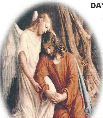
The Agony in the Garden-Jesus "withdrew from them, went down on his knees and prayed. An angel then appeared to him from heaven to strengthen him" - Lk 22,41

We arrive at the HOLY SEPULCHRE to see the Calvary and the Resurrection Tomb .