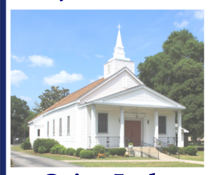
Saint Jude 611 West Oakland Ave Confession: Sat: 4:30-5:30pm (or by appointment) Mass Times Saturday: 6:00pm Sunday: 9:15am, 5:00pm 12:00pm (Spanish)